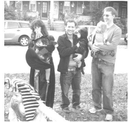
Baby witches, bears and tigers mingled during the festivities